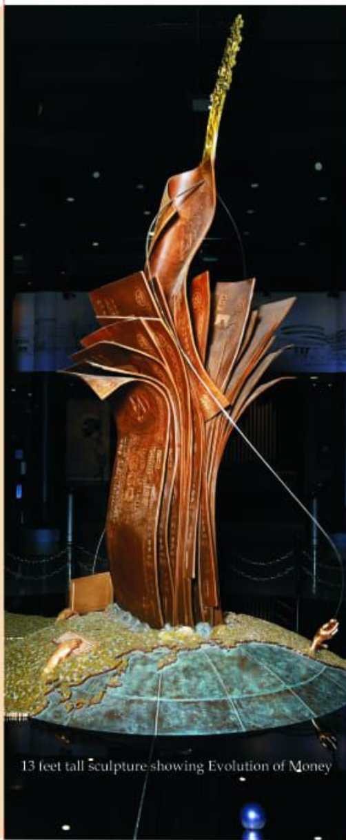
13 feet tall sculpture showing Evolution of Money

The RBI Museum is conceptualised by Reserve Bank of India and developed by Creative Museum Designers