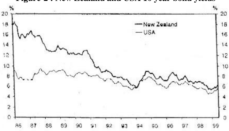
Figure-2: New Zealand and USA 10 year bond yields

The same sort of effect on inflationary expectations was visible in financial markets. As Figure 2 shows, in early 1986 the yield on New Zealand government New Zealand dollar 10 year bonds was roughly 1000 basis points above the yield on US Treasuries. By early 1990, that margin had contracted to about 400 basis points. By early 1994, the yield on the New Zealand government securities was marginally below that on US Treasuries. In the last few years, the yield on New Zealand 10- year bonds has typically been a little higher than on US Treasuries, but the margin looks trivial in relation to that in the mid-eighties.