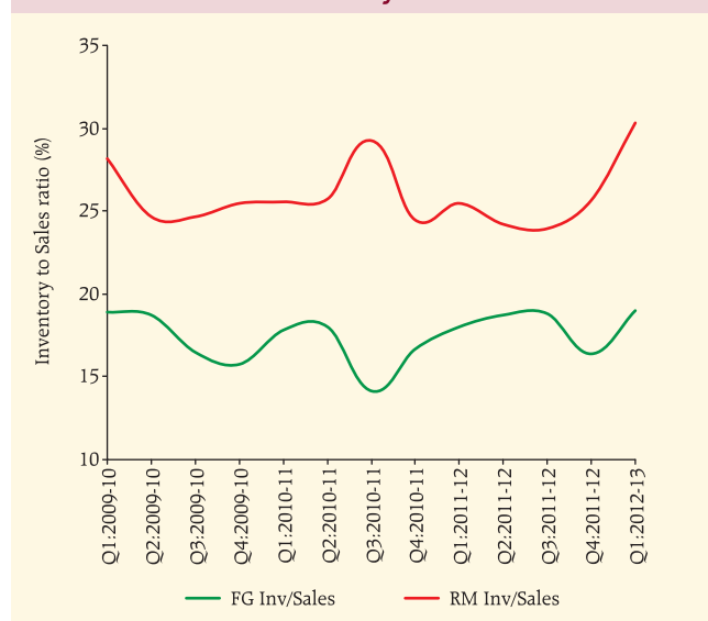
Chart 3: Inventory to Sales Ratio

respondent companies grew at higher rates during Q1:2012-13 as compared with those in the previous quarter. This has reversed the moderation in FG inventory to sales ratio observed during Q4:2011-12. RM inventory to sales ratio rose noticeably in Q1:2012-13 (Chart 3, Table 3), which may be partly due to higher new order growth.