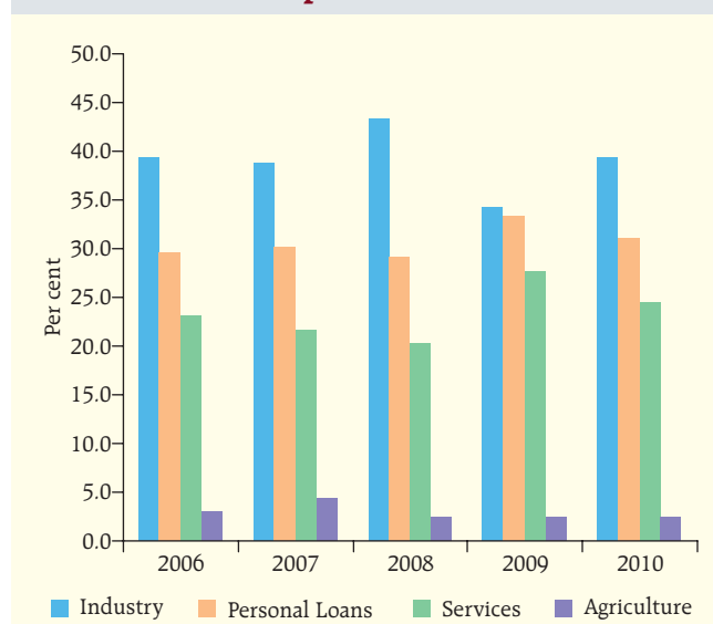
Chart 2: Occupational-share in Credit

low, though 50 per cent of the population was still rural (Chart 2).