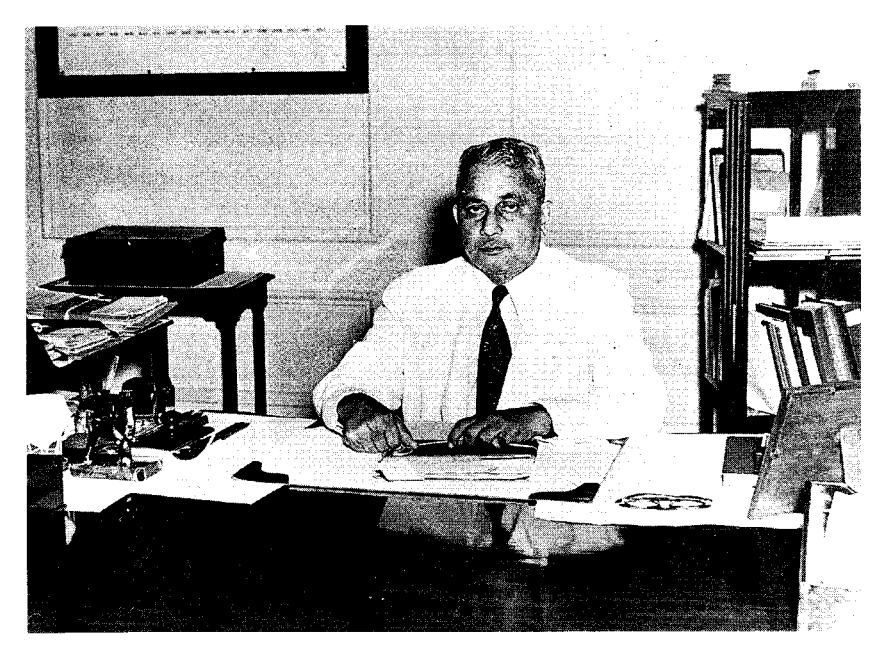
Benegal Rama Rau, Governor, 1949-57

long as the former's call rate on advances was the lower of the two. The last few busy seasons had witnessed a gradual hardening of credit. The Imperial Bank's hundi (indigenous bill) rate, stationary at 3 per cent since November 1935, was raised to 3.5 per cent in January 1949 and to 4 per cent in January 1951. During the 1950-51 busy season the Imperial Bank also raised its call rate for advances of Rs 5 lakhs or more to scheduled banks against government securities from 2.75 per cent to 3 per cent, and that on loans below Rs 5 lakhs from 3 to 3.25 per cent. The major bazaar bill rates and the rates charged by exchange banks on overdrafts too, had been nudging upwards since the last two busy seasons. The general hardening of the Imperial Bank of India's lending rates encouraged banks to approach the Reserve Bank for accommodation and helped revive the Bank rate from its earlier dormant state. But as we saw above, the Bank apprehended excessive credit expansion should its rate became operative at 3 per cent, and felt justified in putting it up by half a point. Although inevitably in this instance, the Reserve Bank of India followed the market rather than led it and the hike in the Bank rate was intended to bring the latter in line with the changes that had already taken place in the interest rate structure, the Imperial Bank responded by raising its discount rate for hundis from 4 to 4.5 per cent and its general rate on advances