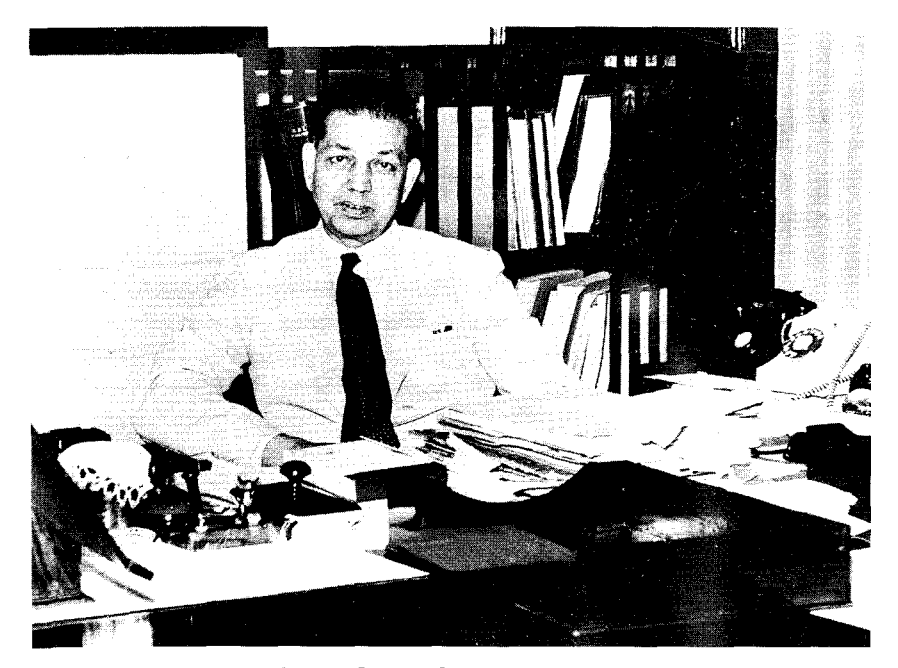
H.V.R. Iengar, Governor, 1957-62

In the event, this policy could not be sustained. As we note in greater detail below, the Bank had begun selectively raising the cost of credit in some segments of the market even from November 1956. As wholesale prices rose nearly 14 per cent through 1956–57, the Bank reverted in July 1957 to the open-market stance it had adopted since November 1951 and up to October 1956. This reversal followed on the heels of an increase in the Bank rate from 3.5 per cent to 4 per cent on 16 May 1957. Alongside putting up the rate, the Bank also recommended a reduction in the stamp duty on usance bills from half a per cent to one-fifth of one per cent.