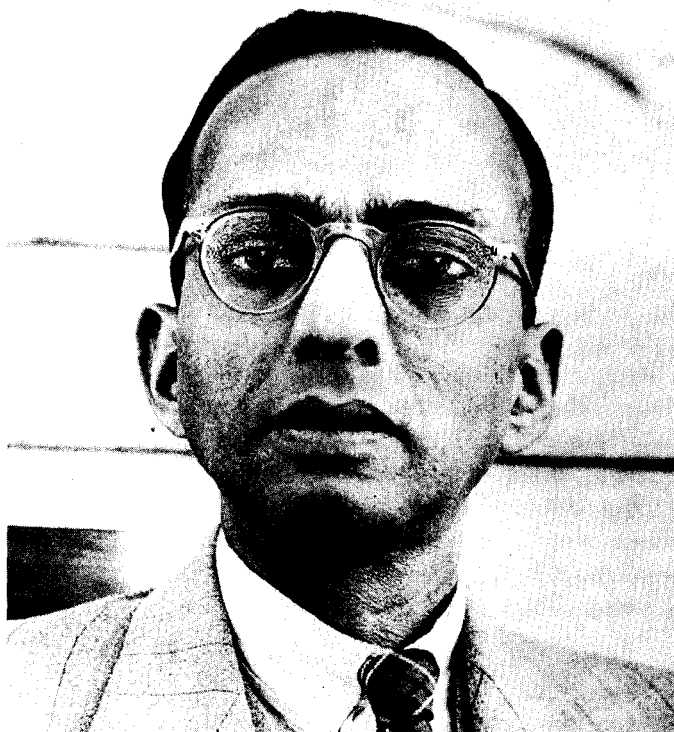
K. G. Ambegaokar, Deputy Governor, 1955-60

when it could continue to make 'free and frequent' use of ad hocs to keep itself more cheaply in funds.