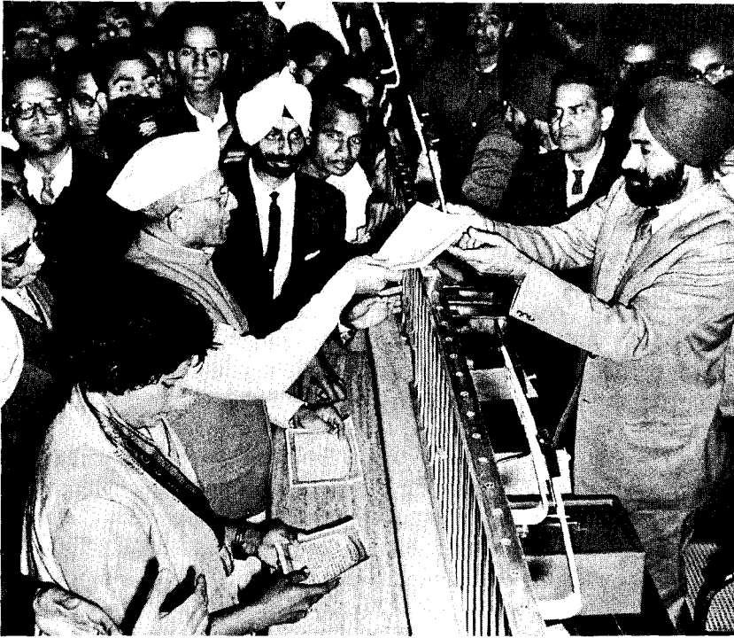
Union Finance Minister Morarji Desai inaugurating Premium Prize Bonds in New Delhi, 1 January 1963

to impress upon the government even as late as March 1963, that there was a 'very strong case' from the 'practical point of view' and from that of 'mobilizing more resources' to preserve the existing arrangement whereby state governments came to the market separately for their requirements since it ensured that the latter took some interest in making their issues 'as much of a success as possible'. State governments did not 'take the same interest when only a Central loan is floated although part of the proceeds are handed over to them'. Besides, the higher rate offered on state loans acted as an inducement to commercial banks who supported state loans 'to a very much larger extent than ... the Central loan'. But the government decided to stick to the course determined by the National Development Council for 1963, especially since in the meantime state governments too had come generally to accept the proposed arrangements.