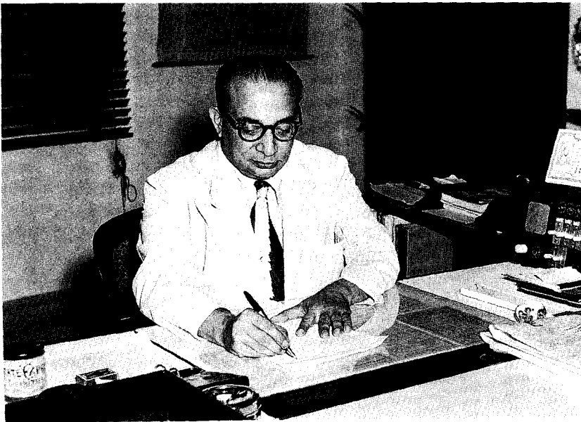
N. Sundaresan, Deputy Governor, 1950-54

The central government's loan operations in the late 1940s were, according to the Deputy Governor, N. Sundaresan, marked by 'continued barrenness'.