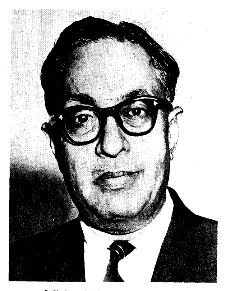
B. Venkatappiah, Deputy Governor, 1955-62

Largely at the Bank's instance, Venkatappiah, Karve, and a team of officers of the Government of India and the Planning Commission undertook a field-study of rural credit in Mysore, Madras, Andhra Pradesh, and Bombay in the summer of 1959, during which they held elaborate discussions with officials and cooperators about the government's plan for a supplementary line of credit. Almost everyone the study team interviewed was sceptical about the plan. Villages did not have production plans, nor could village societies afford to make or help implement such plans. The scheme too made no provision for engaging technical staff who could draw up production plans or otherwise support village societies in their expanded responsibilities. Further, there had