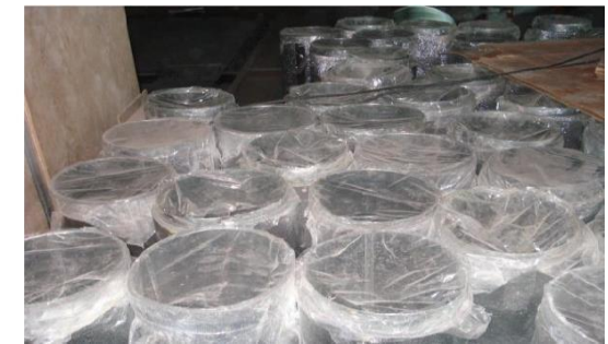
Ducts Stored with Properly Wrapped with plastic