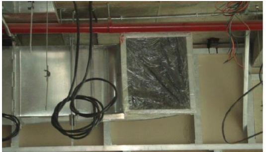
Ducts Wrapped With Plastic To Avoid Dust Cleaning Prior To Installation

Note: The below photographs are given just for reference purpose, they do not refer to any specific brands/makes.