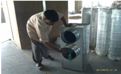
Cleaning Prior To Installation