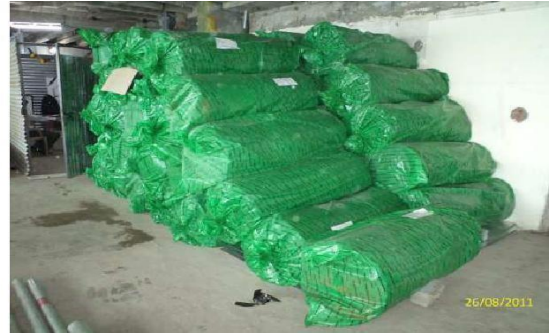
Equipment covered during Construction Phase